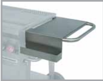
SGC-ST21 Stainless Steel Side Shelf with Sauce Tray