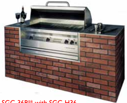
SGC-36BI* with SGC-H36 Smoke Hood option and *optional custom surround