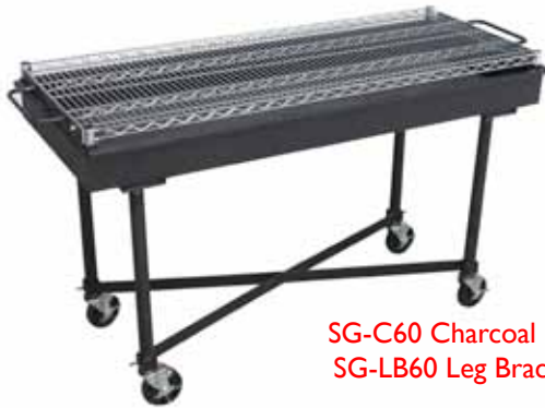
SG-C60 Charcoal BBQ with SG-LB60 Leg Brace Option