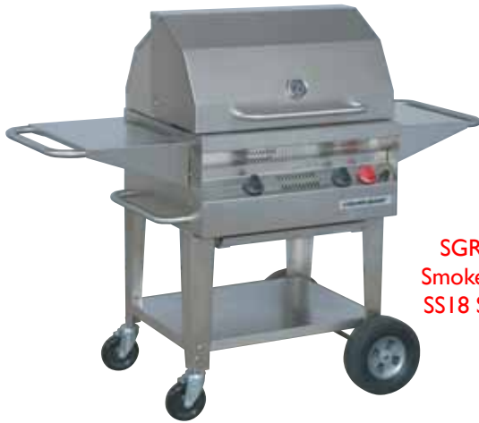
SGR-24 with SGR-H24 Smoke Hood and (2) SGR- SS18 Side Shelves Options