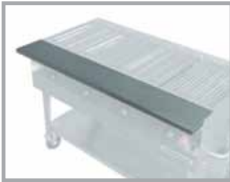
SGC-FR36/48/60/72 Stainless Steel Front Shelf