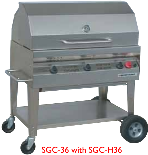
SGC-36 with SGC-H36 Smoke Hood Option