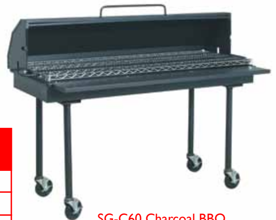
SG-C60 Charcoal BBQ with SG-FSC60 Front Shelf and Smoke Hood SG- HC60 options