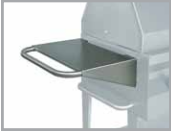
SGR-SS18/SGC-SS21 Stainless Steel Side Shelves

Enhance your grilling experience with the SILVER GIANT™ Accessories Collection