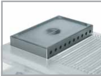
SGC-SPI2 Stainless Steel Steamer Pan