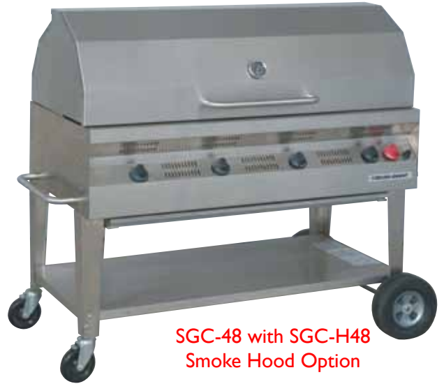
SGC-48 with SGC-H48 Smoke Hood Option