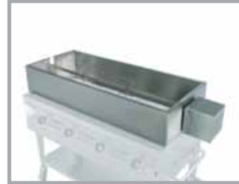
SGC-ROT48 Stainless Steel Rotisserie Kit