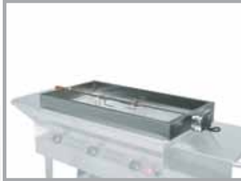
SGC-ROT36 Stainless Steel Rotisserie Kit