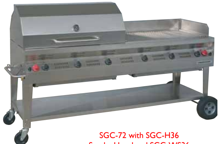
SGC-72 with SGC-H36 Smoke Hood and SGC-WS36 Windshield Options