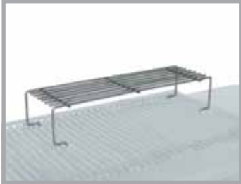
24 WR Stainless Steel Warming Rack