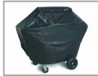
SGC-VC36 Heavy Duty Vinyl Cover