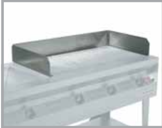
SGC-WS48 Stainless Steel Windshield