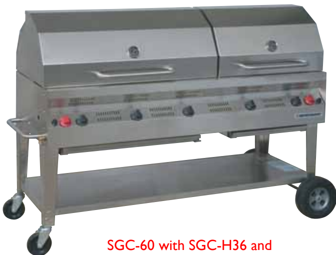
SGC-60 with SGC-H36 and SGC-H24 Smoke Hoods