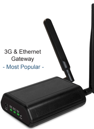
3G & Ethernet Gateway - Most Popular -