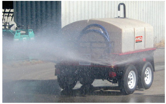
Rear spray bar produces a 30' cone pattern using water pump pressure or a 9' cone under gravity pressure.