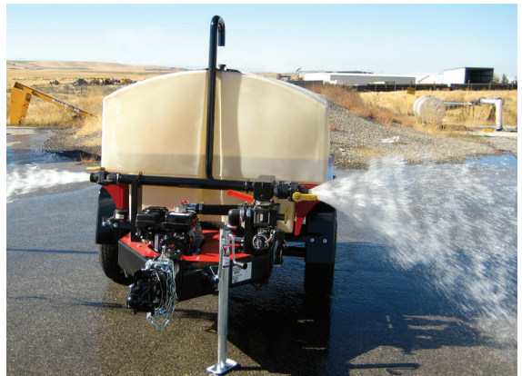
Full left/right 2" discharge demonstrated.